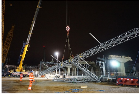
New Overhead Line Equipment (OLE) is installed