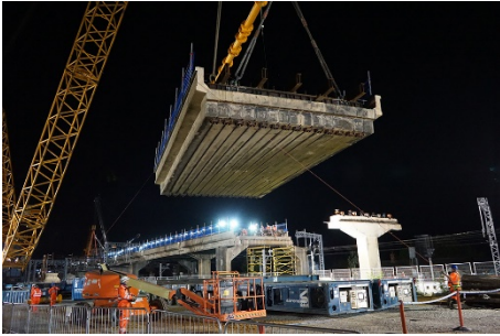
A span is lifted from Bletchley Flyover