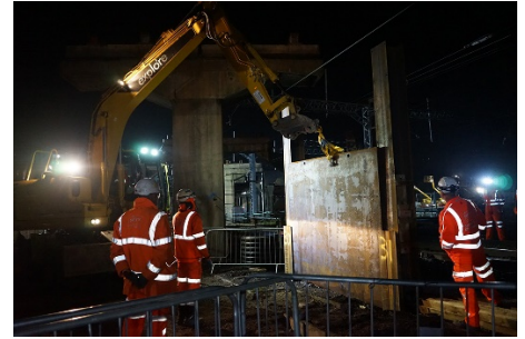
ALO (Any Line Open) protective hoarding is piled and installed

The EWR Alliance has successfully removed 14 spans from the Bletchley Flyover which needed to be dismantled ready for the structure to be rebuilt to modern standards later this year.