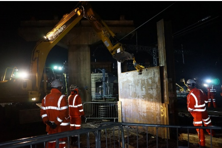
A span is lifted from Bletchley Flyover